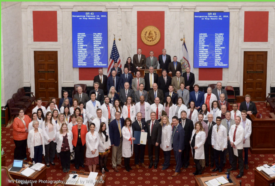
WV Legislative Photography, Photo by Will Price